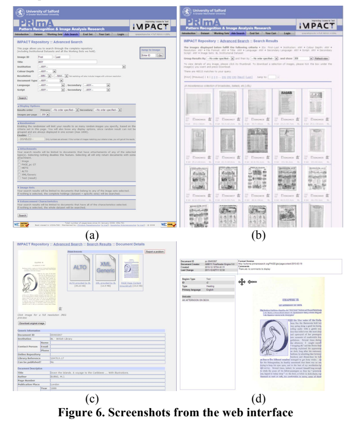
(a) Advanced search interface, (b) Search results displayed as thumbnails, (c) Document preview with metadata, (d) Interactive ground truth viewer

Figure 6a shows a screenshot of the search interface available to the users of the dataset. Figure 6b and Figure 6c demonstrate the web interface with search results displayed as thumbnails and the document preview and metadata respectively. Figure 6d shows the interactive ground truth viewer that is available to preview PAGE files (both ground truth files and processing results) without the need to download both the PAGE and corresponding image file and open them offline.