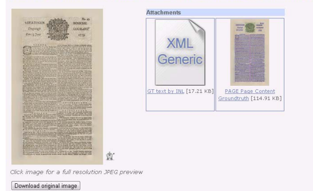
Figure 5. Image with attached files.

IMPACT Repository :: Advanced Search :: Search Results :: Document Details