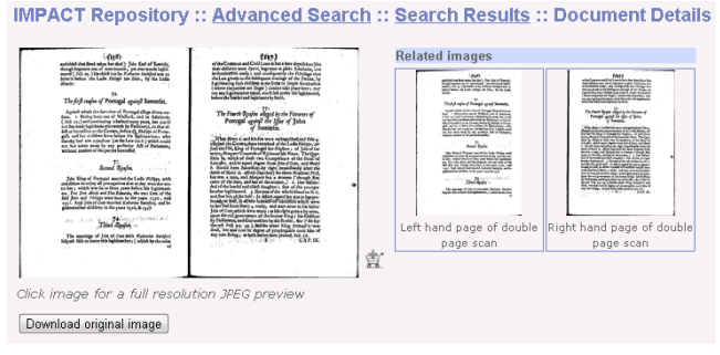
Figure 4. Double page scan linked to left and right pages.

Figure 4 shows a screenshot of the web interface, illustrating the linking between an original image and the corresponding left and right pages.