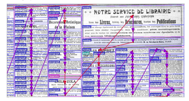
Figure 1. Reading order example

The reading order was captured using the novel feature of ordered and unordered groups, introduced with the PAGE format (see also below), and allows for a more suitable representation of elements for which a definite sequential order is not appropriate (such as adverts in newspapers or articles with no particular order). For practical reasons it was decided only to include textual regions in the reading order and moreover, to exclude certain text subtypes which are not relevant for reconstructing the actual content (for instance page numbers).